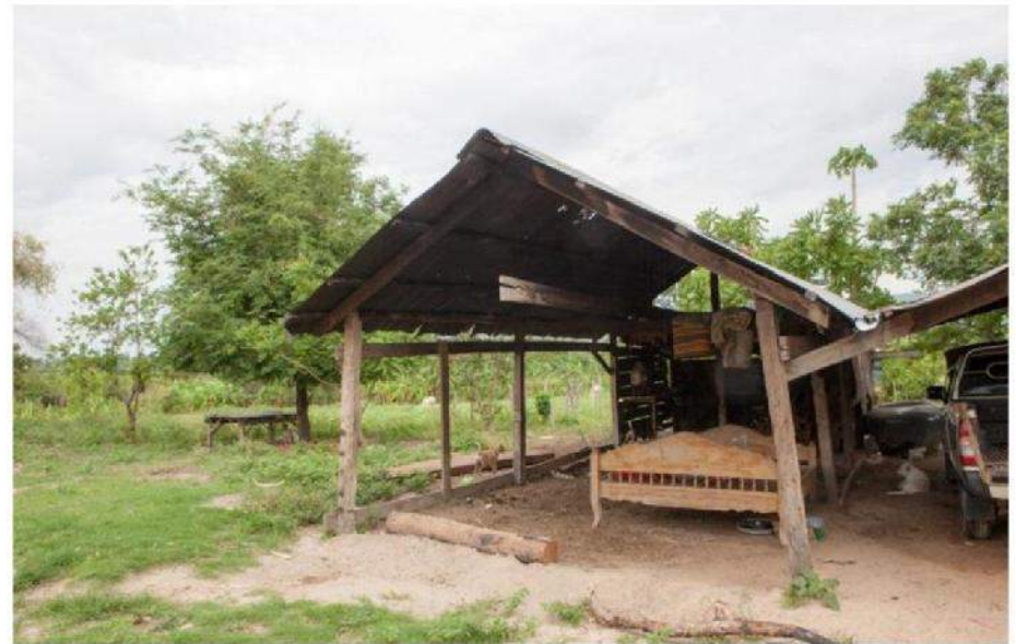
Aspecto actual de la antigua escuela, que tiene ahora otros usos