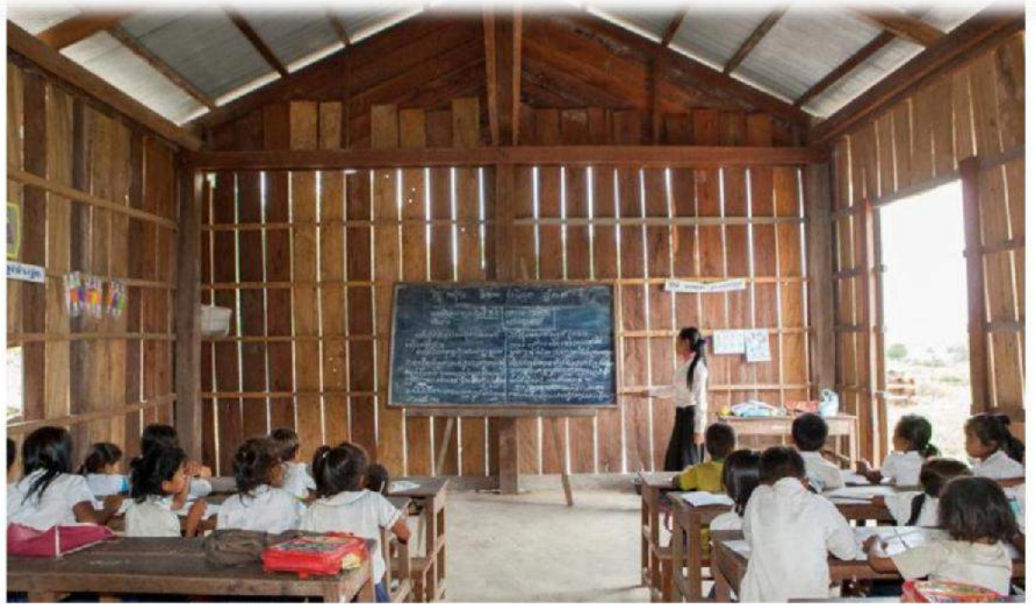
Una profesora imparte clase en la nueva escuela