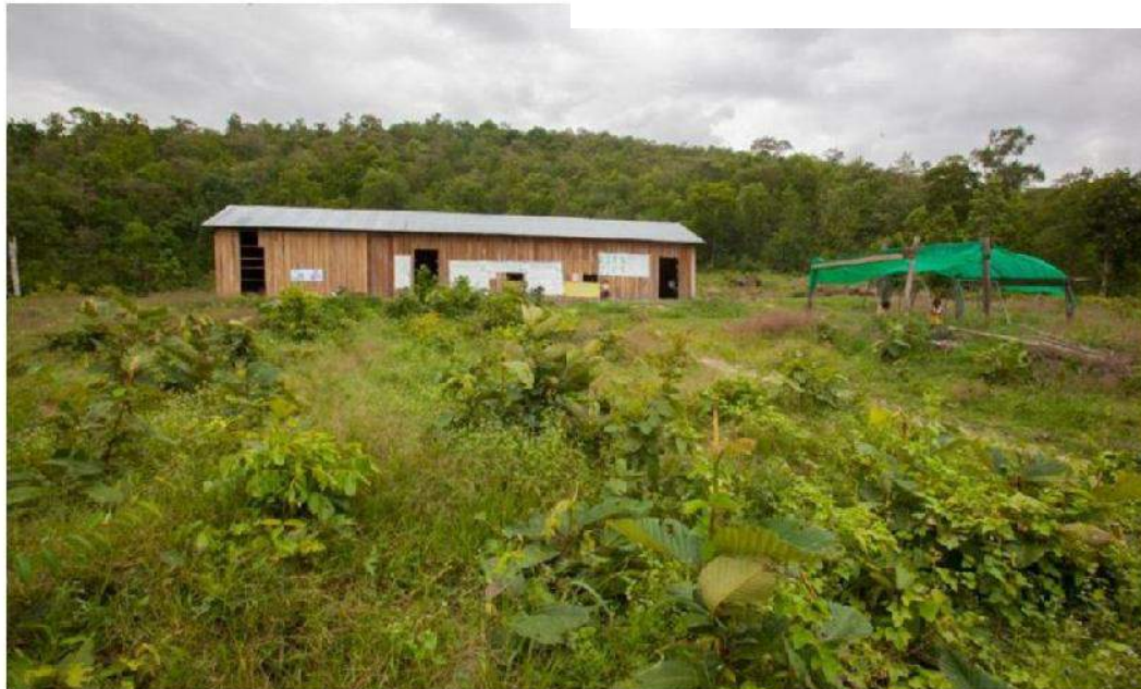
Las aulas y, a la derecha, la zona de juegos con dos columpios