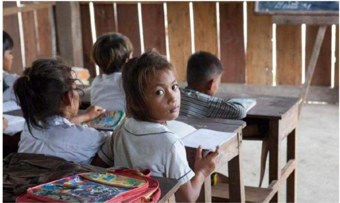
Los alumnos disponen ahora de un espacio seguro y cómodo para aprender