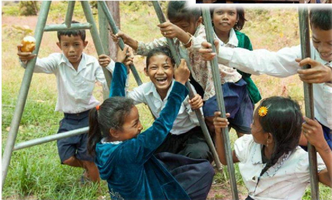
Un grupo de alumnos disfruta del recreo escolar